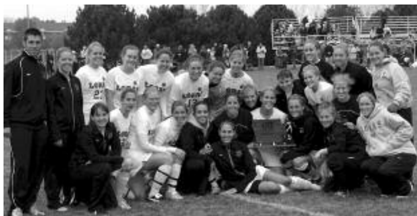
THE WOMEN'S SOCCER TEAM AFTER WINNING THE IOWA CONFERENCE TOURNAMENT AT WARTBURG.